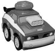
Muscle Car 648861