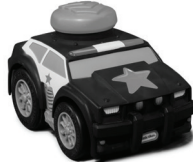
Police Car 647246