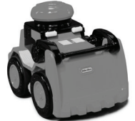
Front Loader 648854

Illustrations are for reference only. Styles may vary from actual contents.