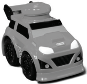
Hatchback Racer 648878

1 Slammin' Racers™ Vehicle (Hatchback Racer OR Muscle Car OR Police Car OR Front Loader Truck)